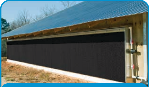
POULTRY COOLING WALL WITH DIAMOND COAT