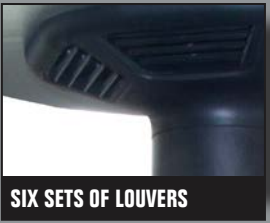
SIX SETS OF LOUVERS